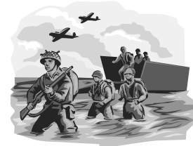
Clip art courtesy of Microsoft