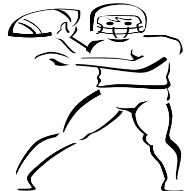
Clip art courtesy of Microsoft