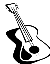
Clip art courtesy of Microsoft