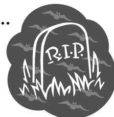
Clip art